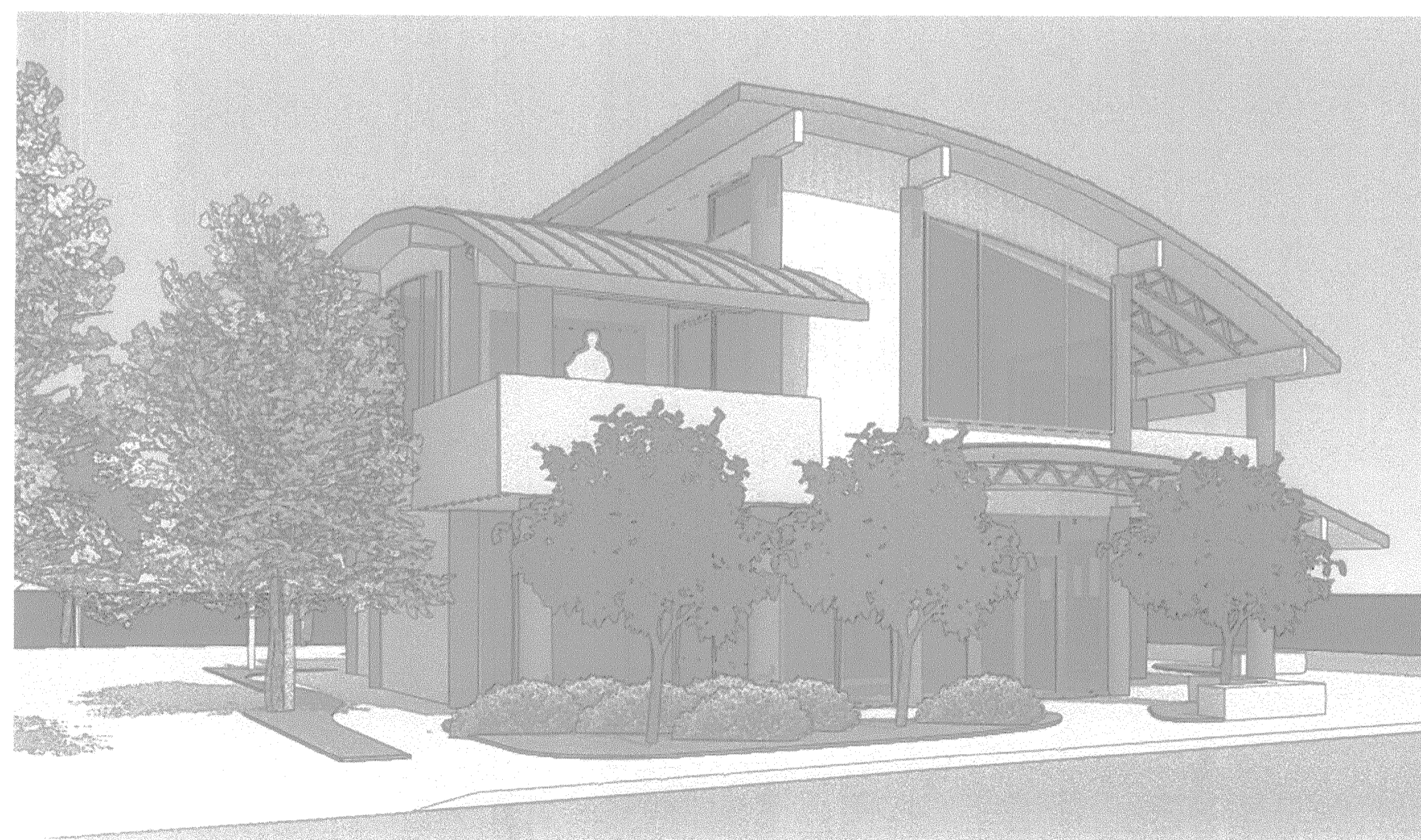
VIEW FM. 41st AVE. TRAVELING SOUTH